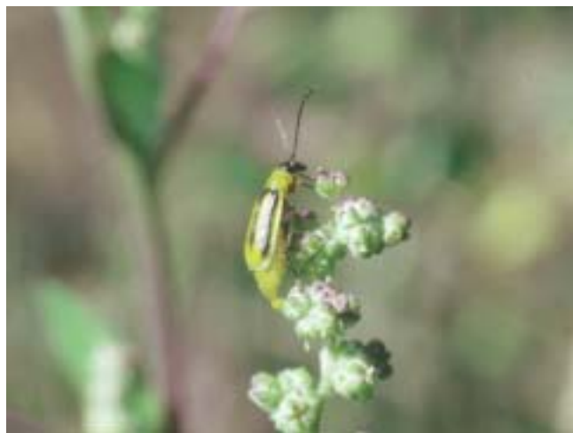
Western Corn Rootworm Feeding On Weed Pollen

In areas where large numbers of western corn rootworm beetles are still active, the potential for larval damage in next year's corn exists. Crop, or non-crop areas, where green plants (e.g., forages, weeds, vegetables, etc.) are present and where corn will be planted in 2003, should be monitored now for rootworm beetles.