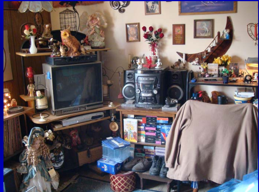
Too many places for bed bugs to hide