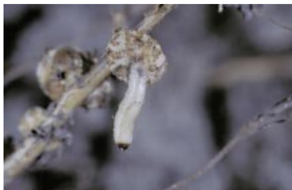
Bean leaf beetle larva feeding on soybean nodule

There are some questions about the bean leaf beetle being a carrier and vector of a viral disease, bean pod mottle virus. Symptoms of bean pod mottle virus may resemble injury from herbicide drift or symptoms of soybean mosaic virus. Infected soybean plants may have mottled or crinkled leaves and plants may be stunted. Plants may also show green stem syndrome, wherein stems remain green after pods have matured. This is not a new disease, it has been recognized in the southern states for years (first identified in 1958). By 1974, this virus was identified in Arkansas, Illinois, Iowa, Louisiana, North Carolina, South Carolina, Mississippi, and Virginia. Why the recent excitement? Certainly the numerous beetles feeding this spring had seed companies contemplating treatment thresholds and the possible added benefit to controlling them to prevent this disease. The symptoms may also help explain, or be an excuse for, some of those mysterious "herbicide drifts" in recent years. Perhaps newer soybean cultivars are more susceptible than in years past. Perhaps with time and research there will be a better answer to this insect/disease relationship. An excellent introductory discussion about this disease is available in Iowa State's April 24 newsletter Integrated Pest Management which can be seen on the web at http://www.ipm.iastate.edu/ipm/icm/2000/4-24-2000/newssoyvir.html .