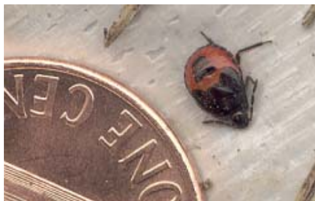
Burrower bug Scott Gabbard, Shelby County, CES

"Burrower bugs are 1/8 to 1/4 inch long insects with sucking mouthparts. The adults are black with a thin gray line around the edge of the body. The smaller nymphs, or immatures, are red and black. Both stages can be seen crawling over and under the soil and surface residue or accumulating in cracks in the soil surface. Burrower bugs can be abundant in and around no-till soybean and cornfields, as well as gardens and lawns. The species uses its sucking mouthparts to feed on sap from the roots of a wide variety of plants. There is no indication that burrowing bugs cause any injury to crops, but densities of several dozen of these bright insects per square foot have raised the concern of farmers, dealers, commercial applicators, and homeowners. In some cases, migrating burrowing bugs have covered the sides of buildings."