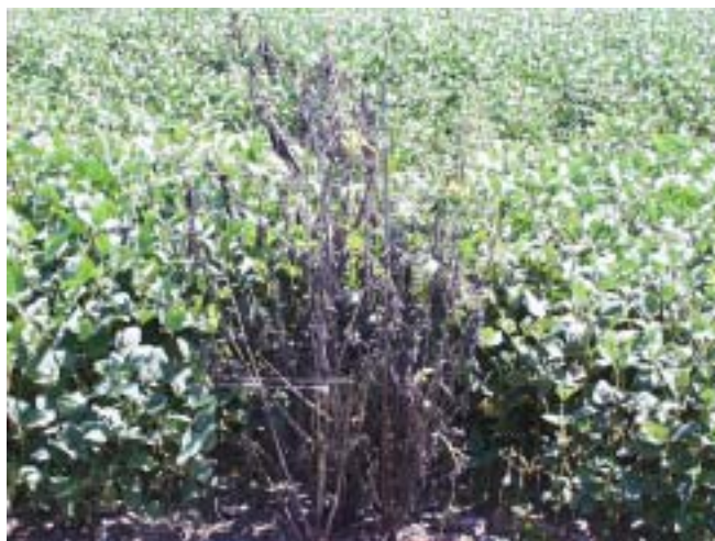
Figure 3. Timely herbicide application(s) [i.e. 3 to 5 weeks after drilling] and crop canopy closure may result in near weed-free fields at harvest (right side of photo) even without a late-season salvage treatment (which needed on the left).

Figure 2. When left untreated until mid- to late-season, giant ragweed will out compete soybean and corn for space, light, and nutrients, and result in total yield loss for the occupied area.