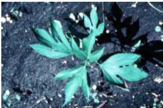
Figure 1. Young giant ragweed showing characteristic three pronged leaves.

For more options please refer to the 2001 Weed Control Guidelines for Indiana at < http://www.btny.purdue.edu/Pubs/WS/WS-16.pdf >. You will need Adobe reader to view the document. To avoid injury to crops and self be sure to always refer to the complete label before using any pesticide.