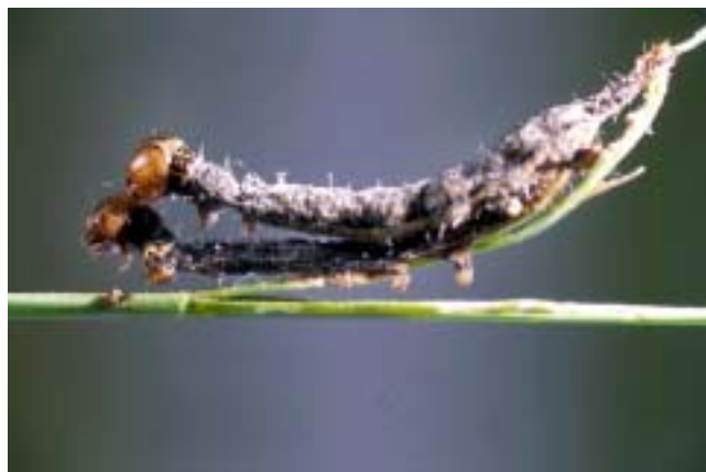
Diseased armyworm larvae