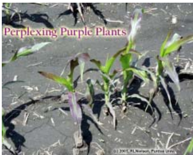
Closer looks at purpling