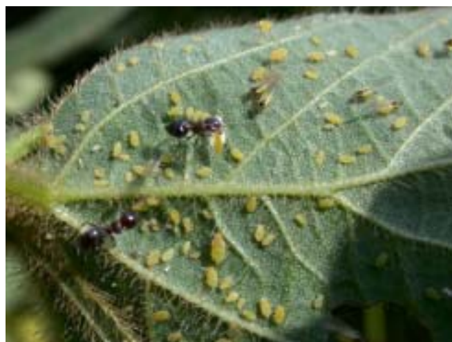
Winged and wingless female aphids with ants

Soybean aphid has a very complicated lifecycle. Simply put, female aphids feed-on and reproduce in the summer on soybean. Females give birth to female off-