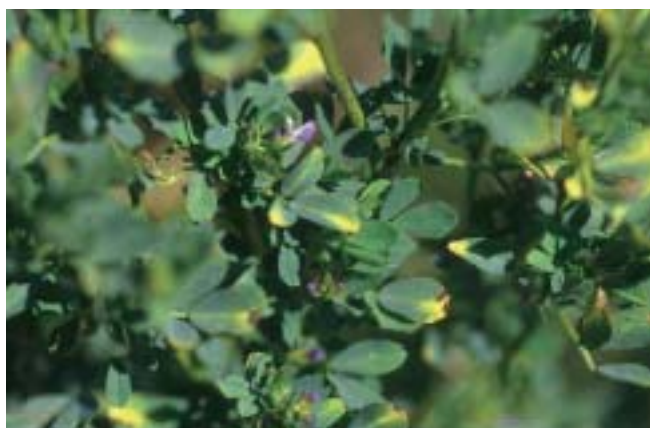
Hopper burn on alfalfa

Producers are encouraged to inspect new growth soon after cutting for potato leafhopper; this is when alfalfa is most susceptible to feeding, leading to reduced yields and protein levels. Remember, once yellowing or "hopper burn" is seen, the damage has already been done. Refer to Pest&Crop #13, for sampling and management guidelines. For recommended insecticides, see E-220, Alfalfa Insect Control Recommendations – 2002 . This and other field crop related publications can be viewed electronically at http://www.entm.purdue.edu/entomology/ext/targets/e-series/fieldcro.htm .