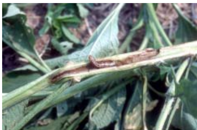
Stalk borer and damage in giant ragweed stem

Darrel Daniels, BASF, has made us aware of some poor performance complaints with post-emergence herbicide applications on giant ragweed. During field surveys, it was noted that some plants were wilting due to factors not related to herbicide activity. Some ragweed plants were split open and revealed extensive tunneling by stalk borer larvae. Obviously, this insect's tunneling activity prevented sufficient translocation of the herbicide in the ragweed plants to kill them. Not only is giant ragweed a favorite egg-laying site for stalk borer moths in the fall, but also a host for the larvae in the spring. Stalk borer can be an efficient biocontrol agent for ragweed, however, it can also kill adjacent plants, such as corn, thus limiting its usefulness as a weed control agent.