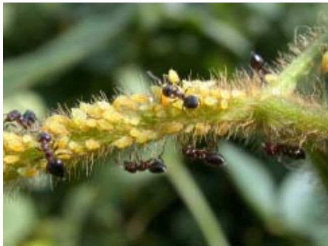
Aphids on stem tended by ants

Further information with many color pictures can be found in extension publication E-217, Soybean Aphid (new May 2001). A hard copy of this publication can be obtained by calling 1888-EXT-INFO or an electronic copy viewed at < http://www.entm.purdue.edu/entomology/ext/targets/e-series/e-list.htm >.