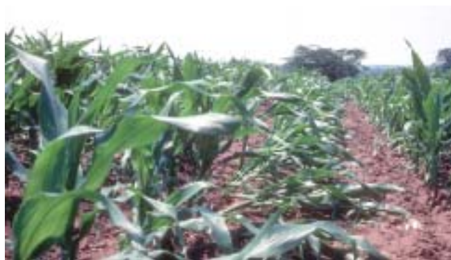
Late-planted corn lodging from rootworm damage

Rootworm larval feeding causes reduced water and nutrient uptake and can lead to standability problems. Major yield losses occur when nodal and brace roots are so severely damaged that plants lodge. Research has shown that even though plants attempt to right themselves (goose neck or sled-runner look), on average, there is at least a 30% yield loss. Obviously, losses will be more dramatic if winds blow the plants over shortly before or at pollination.