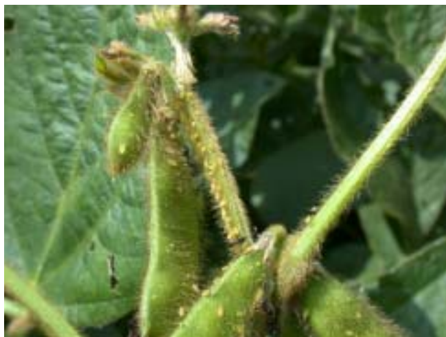
Aphids on stems and pods