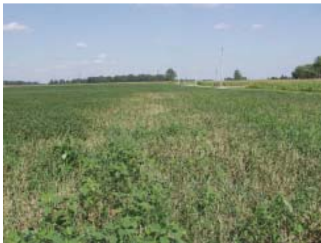
Fig. 1. Defoliation of soybean plants with SDS along the turn-row of a soybean field.

Two weeks ago, we cautioned that high risk for Sudden death syndrome (SDS) was prevalent in Indiana ( Pest&Crop No. 20) based on observations in farmers fields and Abney's and Westphal's research plots strategically located in southern and central Indiana. At that time, we reported awareness of SDS in highly susceptible varieties. In brief, these conditions include high soil moisture at the beginning reproductive stages and early planting. Currently, foliar symptoms of SDS are most evident across southwest Indiana. When traveling in southern Indiana, we observed large areas with SDS. Symptoms were seen in about half of the fields. Soybeans in fields with SDS are in growth stages R5 to R6 (pod fill), the typical time for the disease to show-up.