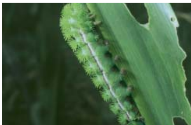
Io caterpillar in corn (stings)

Pest managers occasionally observe peculiar-looking caterpillars feeding on the leaves of corn and soybean this time of the year. Look carefully before you touch! Two species, the Io moth and the saddleback caterpillar, found in fields can sting when handled! Though both species can be found on many different plants, in field crops the Io feeds on both corn and soybean, while the saddleback is only encountered in corn.