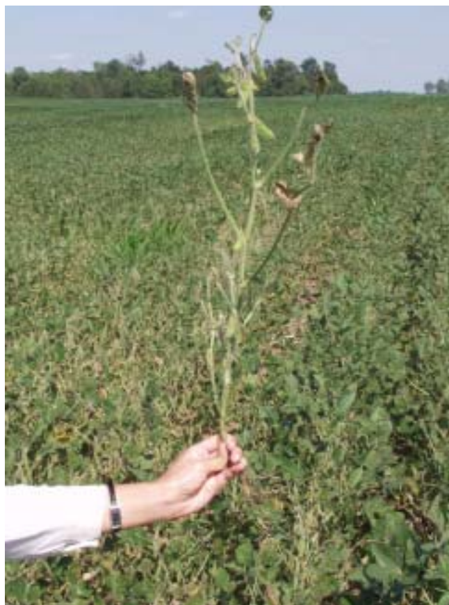
Fig. 2. Single soybean plant with severe SDS: note that blades and pods have dropped off while petioles remain attached to the main stem.

the progression of SDS, leaflets die and shrivel and drop off, leaving the petioles (leaf stalks) attached. While brown stem rot has similar foliar symptoms, it is distinguished from SDS by symptoms in the plant stem. Brown stem rot darkens the pith but not the cortex. In contrast, the lower stem and taproot of a plant with SDS will exhibit a dark-brown cortex, but white, maybe tan, pith. If a plant with symptoms of SDS is dug from moist soil, there may be small, light-blue patches on the surface of the taproot. So if you suspect SDS in a trouble field you want to dig SDS-suspect plants from the soil, inspect the roots for a blue coating of SDS spores and split the stem.