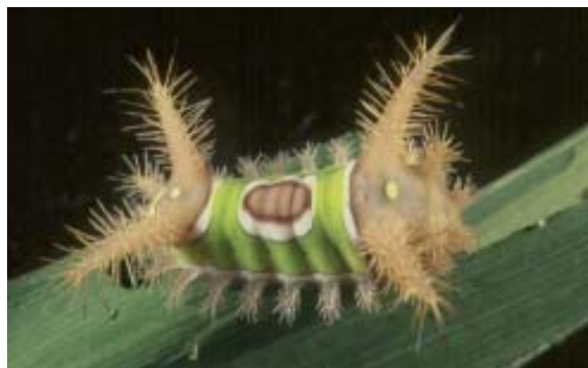
Saddleback caterpillar in corn (stings)