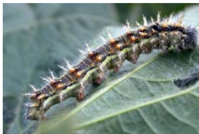
Thistle caterpillar (harmless)