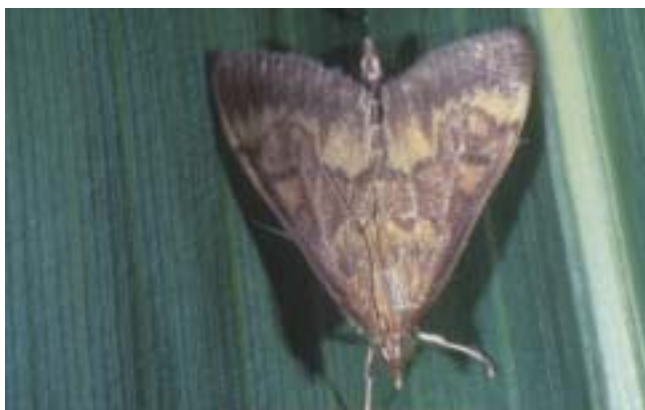
European corn borer moths: female (top), male (bottom)