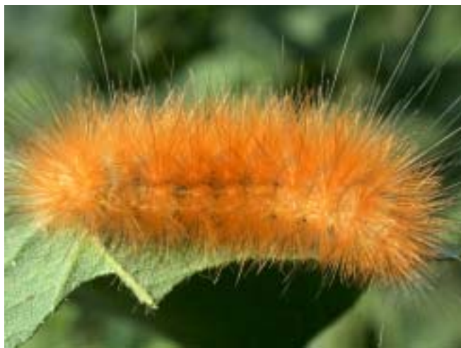
Woollybear caterpillar (harmless)

The bodies of these caterpillars are covered with “stinging” or “nettling” hairs, which produce a stinging sensation and temporary rash when the caterpillars come into contact with the skin. These stinging hairs resemble spines; whereas the often encountered and harmless woollybear is just hairy looking. To add confusion to the matter, there are many more formidable looking caterpillars found on various plant species that are harmless. The old adage “when in doubt, leave it alone” applies here. Happy Scouting!