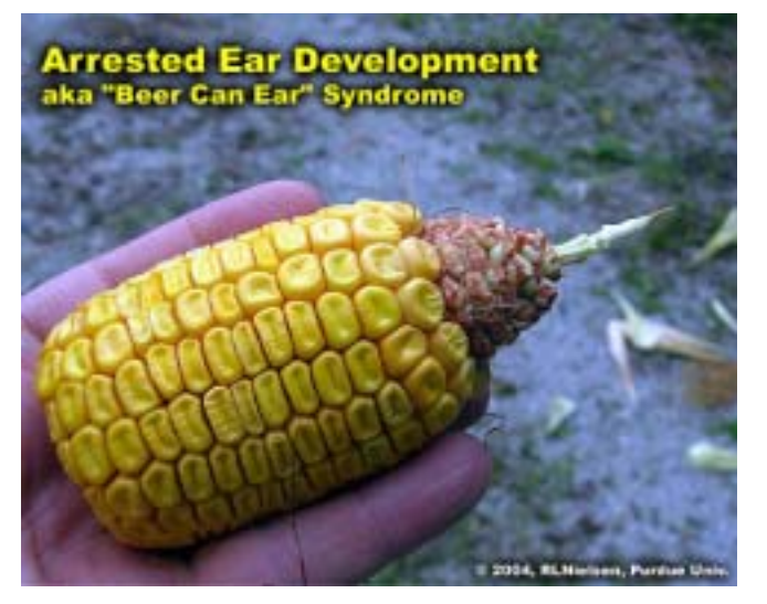
Arrested ear exhibiting "bony" cob structure and rudimentary ear shoot at tip of ear.