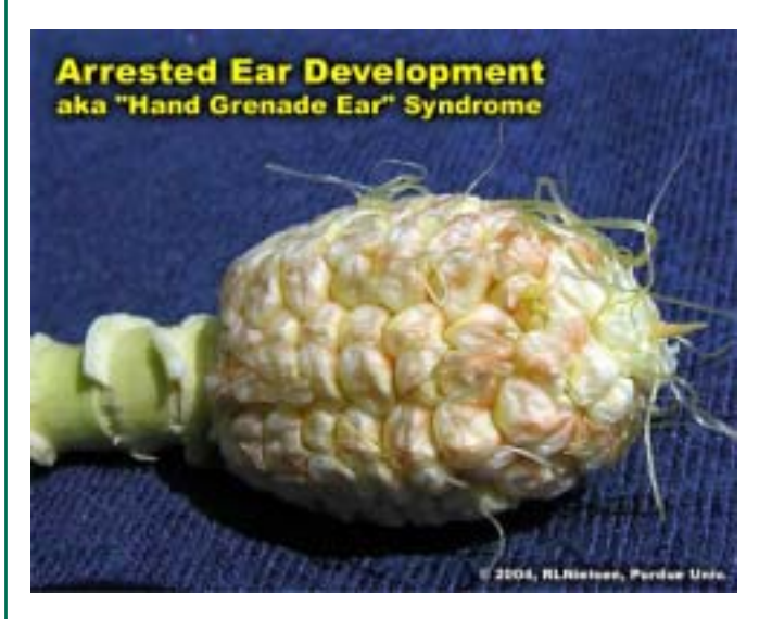
Classical symptom of "hand grenade" ear symptom.