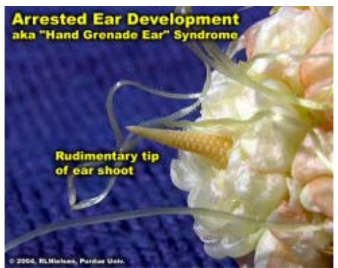
Closer view of rudimentary tip of ear shoot commonly found on arrested ears.