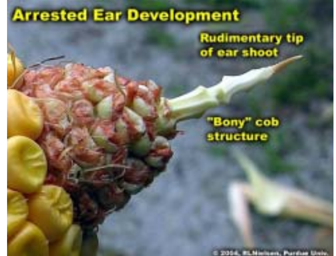
Closer view of "bony" cob structure and rudimentary ear shoot at tip of ear.