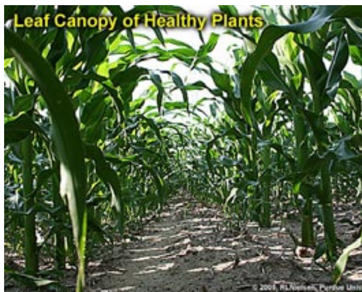
More dense crop canopy of healthier plants.