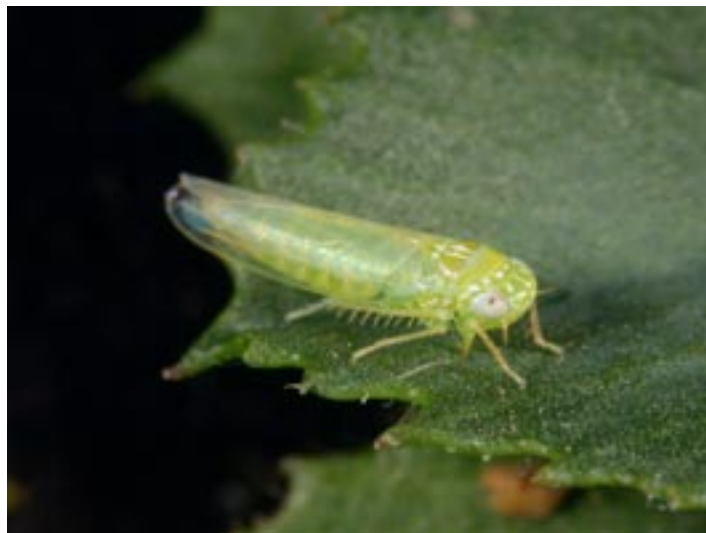
Close-up of a potato leafhopper

Producers are encouraged to inspect new growth soon after cutting for potato leafhopper; this is when alfalfa is most susceptible to feeding, leading to reduced yields and protein levels. Remember, once yellowing or “hopper burn” is seen, the damage has already been done. Refer to Pest&Crop #10, for sampling and management guidelines. For recommended insecticides, see E-220, Alfalfa Insect Control Recommendations – 2005 . This and other field crop related publications can be viewed electronically at < www.entm.purdue.edu/entomology/ext/targets/e-series/fieldcro.htm >.