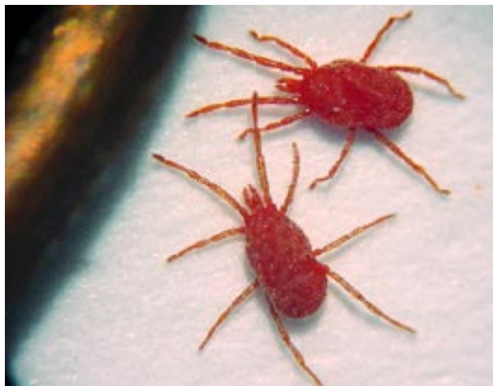
Clover mites, greatly enlarged

After emerging, beetles will begin to feed on corn leaves if pollen is not available. This leaf feeding damage may look dramatic in small areas of a field, but is usually of no economic importance. This year's replanting will cause some fields to pollinate much later than most. These fields will act as "magnets", attracting large numbers of beetles and need to be watched for silk clipping. If beetles are present and feeding on corn silks, an insecticide application should be considered only if 50% of the silks are being cut off to less than 1/2 inch before 50% pollination has taken place. Note, this threshold is NOT based on beetles per plant.