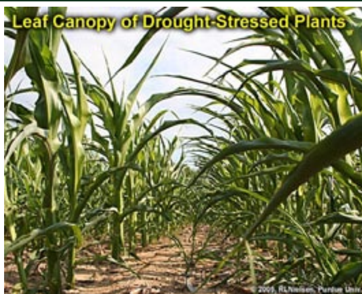
Very sparse crop canopy due to severe leaf rolling.

Leaf rolling typically occurs first in fields where soil moisture or root development is already restricted: e.g., sandy soils, field edges near tree lines, end rows (compacted soil), other areas of compacted soil, nutrient deficient areas, nematode-damaged areas, rootworm-damaged areas, and areas of severe weed pressure. As drought conditions worsen, leaf rolling eventually spreads throughout entire fields.