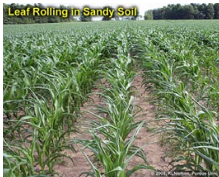
Leaf rolling occurring in sandy soil, but not heavier textured soil.