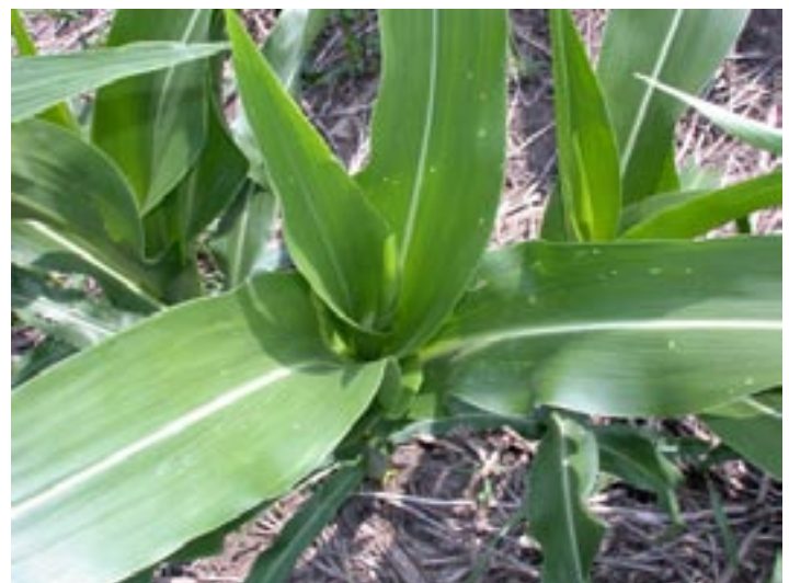
Shot hole damage in corn whorl

To scout for corn borer damage, survey for the characteristic random or "shot hole" damage pattern down in the corn whorl of 20 consecutive plants in each of 5 areas of the field. Carefully examine the whorl leaves on each plant, as some of the holes can be small. Count and record the number of plants showing foliar feeding damage. Total