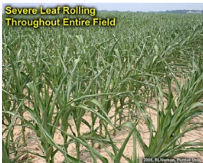
Severe leaf rolling throughout entire field.

Hybrids often vary for severity of leaf rolling. Side-by-side in the same field, one hybrid may exhibit severe leaf rolling while the other shows no such effects. Which is most affected by the soil moisture deficit? Some argue that the hybrid that rolls its leaves earlier may be better off because of lower transpiration rates. Others argue that the hybrid that doesn't roll its leaves as easily may simply be more drought tolerant. In practice, the leaf-rolling characteristic is only one of several drought tolerance tactics breeders can exploit (Bänzinger et. al., 2000).