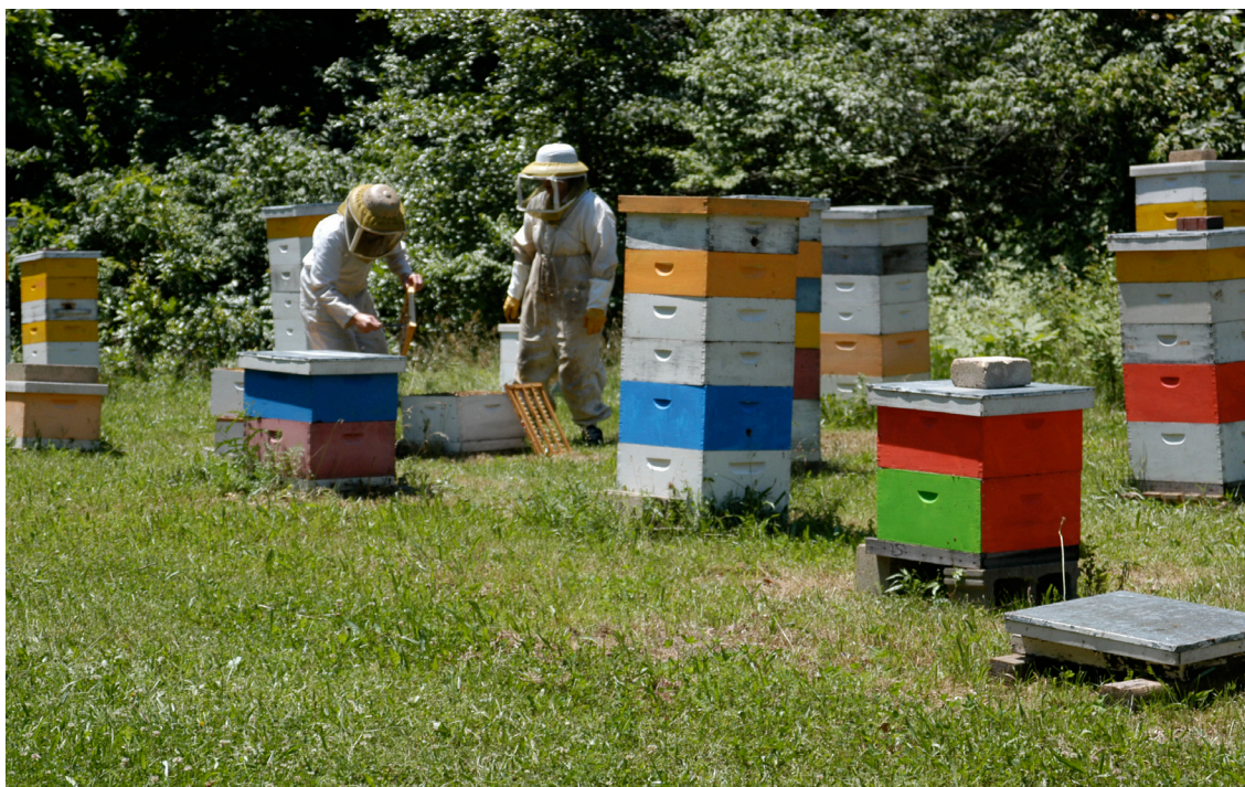
Beekeepers inspecting hives