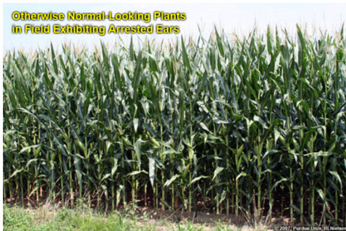
Otherwise Normal-Looking Plants in Field Exhibiting Arrested Ears