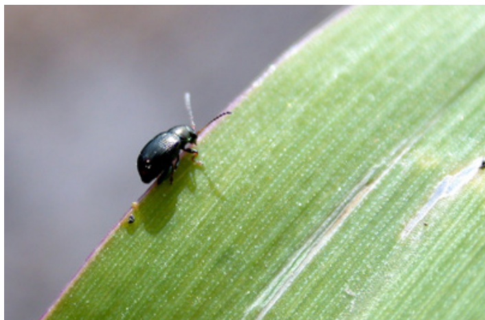
Close-up of corn flea beetle and feeding scars