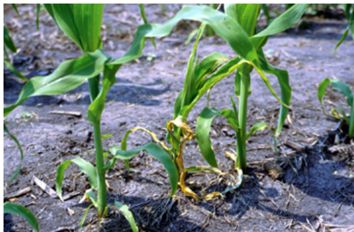
Stewart's wilt of corn