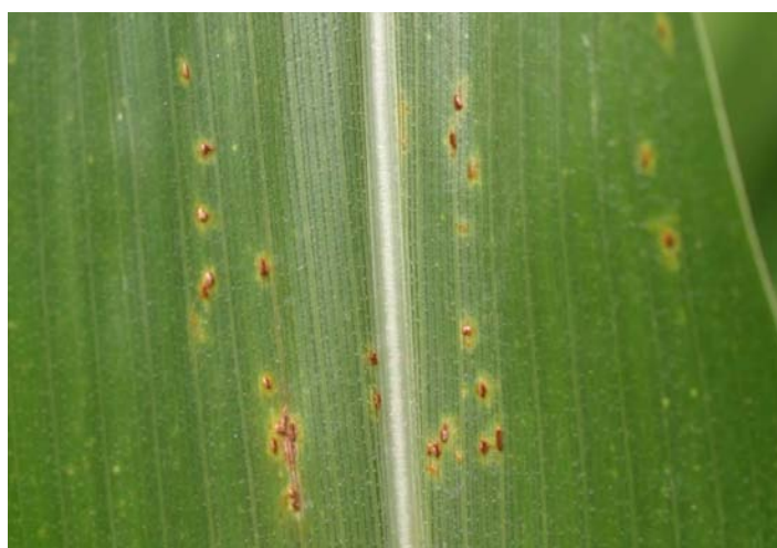
Common rust on hybrid corn

A few pustules on a plant do not necessarily warrant treatment. There are no reliable thresholds established for common rust levels in hybrid corn, so it is hard to determine when the level of rust has reached an economically damaging level. Fungicide applications are recommended when rust is present on 50% of plants of a susceptible variety of seed corn. Hybrid corn can probably tolerate a much higher threshold, but if severe infections are present on a highly susceptible variety and if mild, humid weather conditions are present, rust spread may occur, and fungicide application may be an option for disease management.