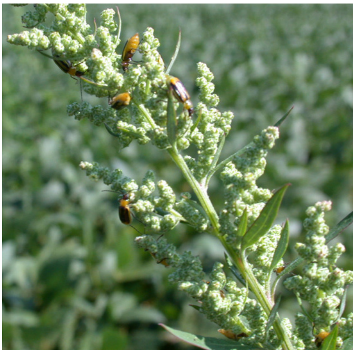
Western corn rootworm beetles feeding on lambsquarters

Corn fungicide aerial applications are in full swing throughout the state. Hopefully pest managers are checking these fields for beetle numbers before unknowingly tank mixing an insecticide with fungicide. Most have indicated to us that there is an awareness of lower beetle numbers this year and that willy-nilly insecticide use is minimal.