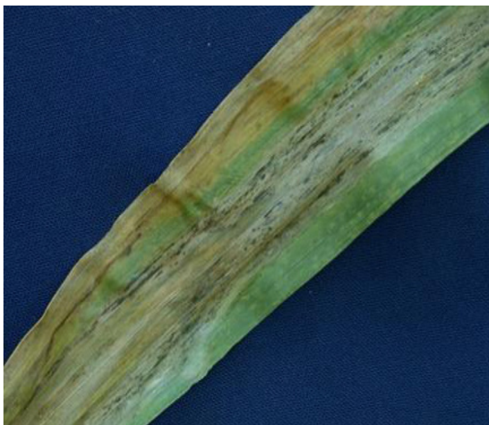
Figure 1. Diagnostic lesions of Goss's wilt with dark specks or 'freckles' present in the lesion.