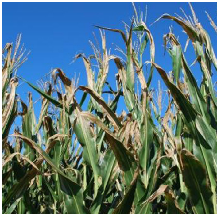
Figure 3. Blighted areas in the upper canopy of infected plants.

disease is not insect-transmitted, like Stewart's Wilt, and relies on wounds for dispersal. Once seed to seedling transmission occurs, disease spreads in areas that have experienced hail-damage or wind-driven rain. Early hailstorms and recent heavy rains and windstorms likely contributed to the infection and dispersal of Goss's Wilt in fields in Indiana.