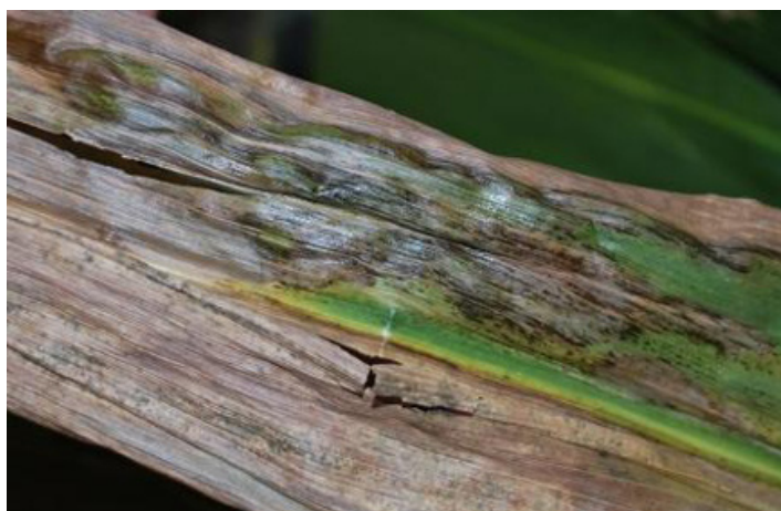
Figure 2. Bacterial ooze present on the lesion surface will appear shiny in sunlight.