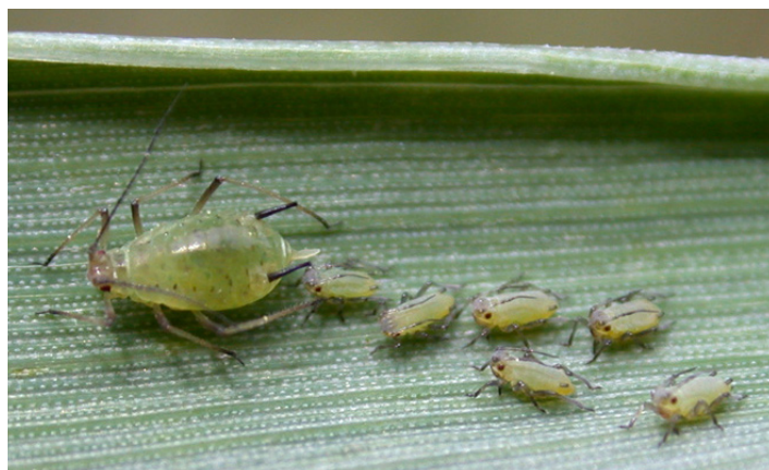
English grain aphid adult and nymphs on wheat leaf

Aphids feed on wheat leaves by sucking plant juices with their straw-like mouthparts. This feeding has very little effect on the growing plant when moisture is available in the fall. This season, some wheat seed and/or seedlings may