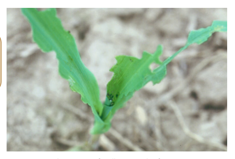
Armyworm feeding on 4-leaf corn

Corn - Corn that has been no-tilled into or growing adjacent to a grass cover crop (especially rye) should be