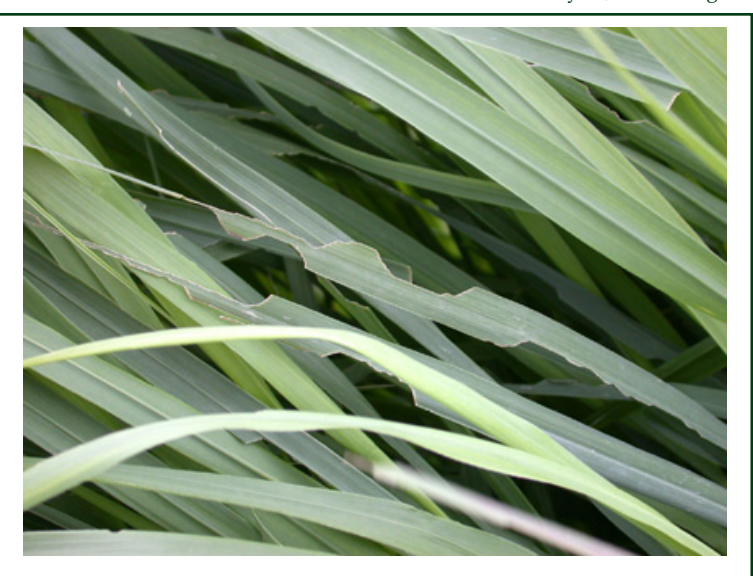
Armyworm feeding on forage grass