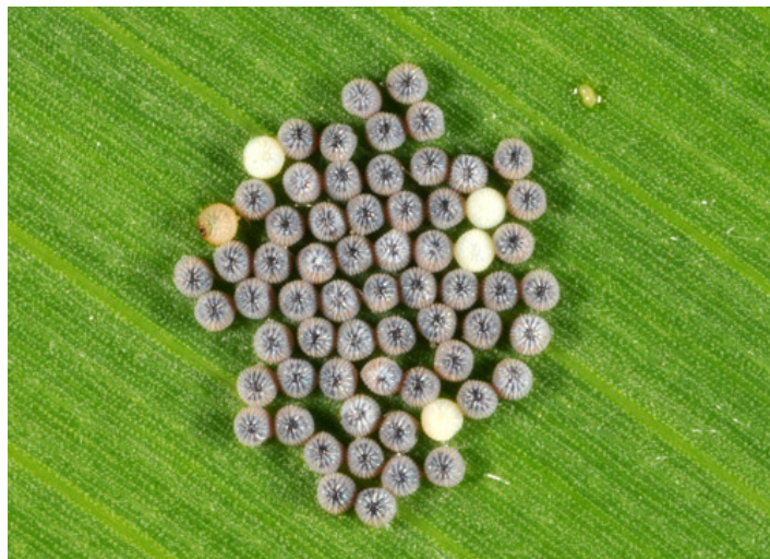
Egg hatch within hours

feed on leaf tissue and could easily be confused with other insect pests such as fall armyworm. In corn that is tasseling, larvae will feed on pollen in the leaf axils. Eventually, larvae will enter the ear by following the silks down to the kernels. Larvae within the ear are protected from insecticide applications, so scouting and timely treatment are a must for this pest.