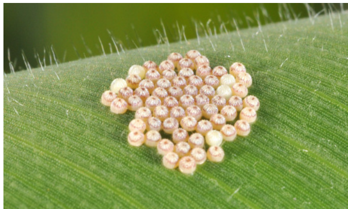
Developing egg mass