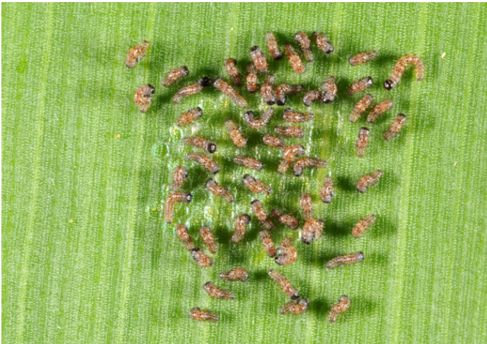
Newly hatched larvae eating their egg shell

Fields with at least 5% of plants with egg masses and/or young larvae, without the Cry1F (Herculex 1) trait, should be considered for treatment. Ideally, this could be aerially applied in combination with fungicide that has already been prescheduled. We continue to discourage indiscriminate use of insecticides (and fungicides) just because western bean cutworm moths are being captured. Consultants within the high moth capture areas are seeing tremendous variability between egg mass counts within neighboring fields.