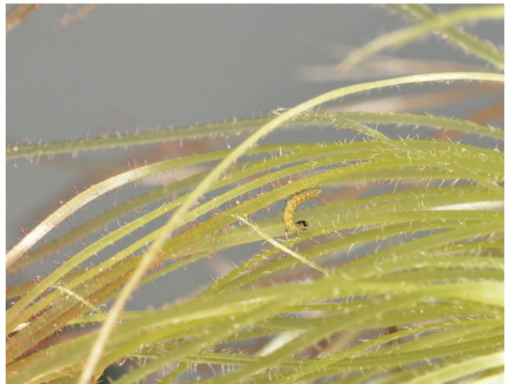
Newly hatched larva within the silks