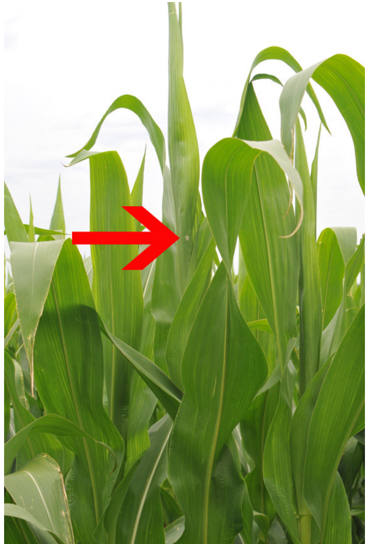
Arrow pointing to egg mass on upper leaf