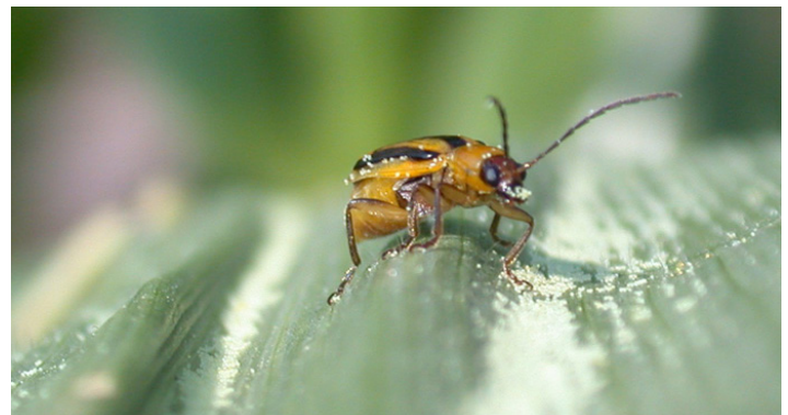
Lonely western corn rootworm beetle feeding on pollen

There are likely several factors at play. In Indiana, we had very heavy rains in early June during 2008 that likely drowned many larvae. This was followed by low adult numbers in the late summer and fall of last year – likely leading to lower egg loads. This spring, planting was delayed by frequent storms in both IL and IN, along with cool temps throughout the region. Both these factors probably combined to lower larval pressure on corn this year (partly because corn was planted late, and partly due to larvae once again drowning following rain events).