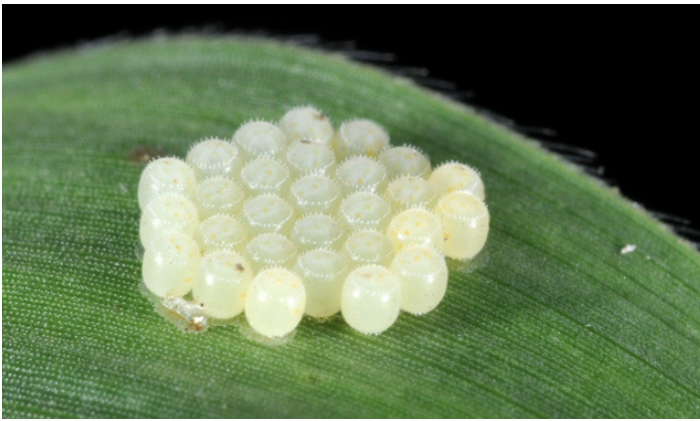
Barrel-shaped stink bug eggs, with a ring of decorative beading, are often confused with a WBC egg mass