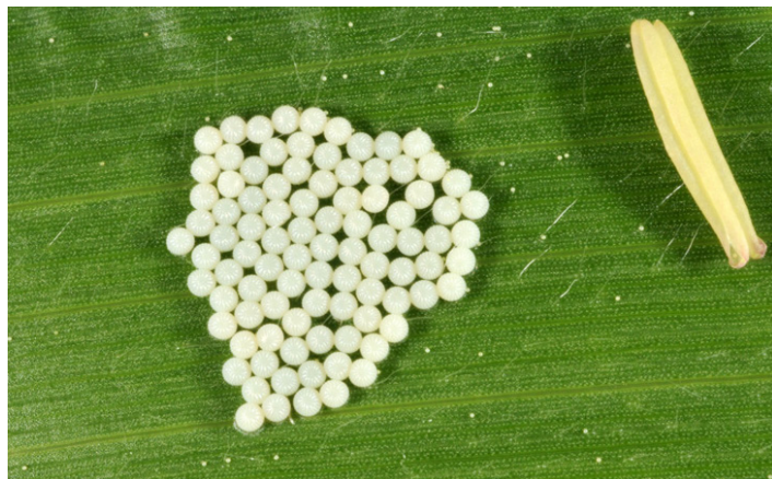
Fresh laid egg mass

Corn that is near, or at tassel, should be monitored for egg masses. Eggs are usually found on the top leaf surface on the upper leaves of the plant. Concentrate on the leaves wrapped around the soon to emerge tassel - there the egg masses may be on the bottom of the leaf because of the upright orientation. Fresh egg masses are white, and progressively darken to deep purple just before hatch in about a week. Obviously, the window for scouting and treatment is short. After hatching, the minute larvae devour the remaining eggshell (so egg masses disappear) and crawl to protected areas such as the whorl or leaf axils. In the whorl, the larvae