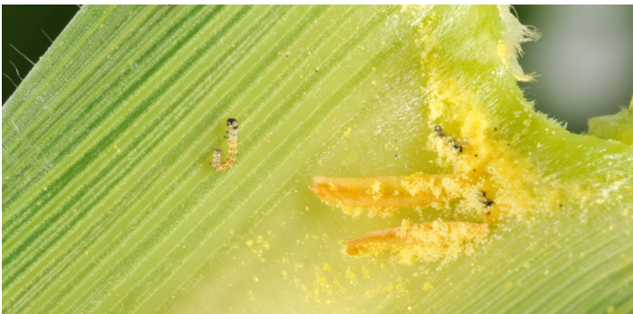
Larva in the leaf axil feeding on pollen

Recommended foliar insecticides for western bean cutworm can be viewed at http://extension.entm.purdue.edu/publications/E-219.pdf .