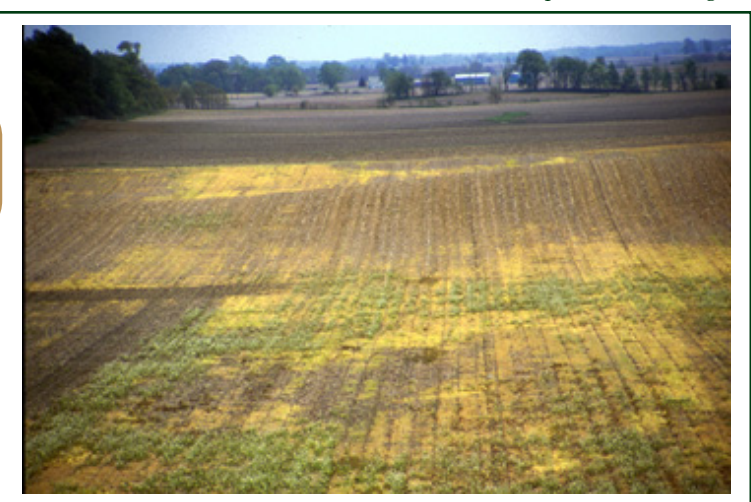
An attractive field to a female cutworm moth

As shown in this week's "Black Cutworm Adult Pheromone Trap Report," this insect has begun its arrival into the Midwest. Female cutworm moths are particularly attracted to winter annuals, such as chickweed and mustards in which to lay their eggs. Fields that are showing plenty of green are at highest risk for cutworm damage. Corn and soybean are among the cutworm's least favorite foods, it just so happens that these are the only plants remaining by the time larvae have emerged and weeds have been killed. Research has shown that cutworm larvae starve if weeds are treated with tillage or herbicide 2-3 weeks before crop emergence — an example of a case when controlling weeds can help manage insect pests.