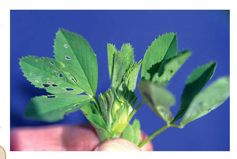
Alfalfa weevil pin hole damage

return. If the application of an insecticide is required early in the weevil season, producers have the option of using a material that has good residual action. Later in the season, short residual insecticides should be used and producers should pay close attention to harvest restrictions. Management guidelines, which are based on heat unit accumulations, will be given in next week's Pest&Crop .