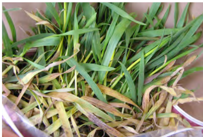
Figure 4. Plants infected with soilborne viruses (WSSMV; SBWMV) may develop reddish-purple coloring on lower leaves

The level of symptom expression can depend on variety susceptibility. Soilborne wheat mosaic virus can cause a rosette symptom in susceptible varieties, which results in excessive production of severely stunted tillers. We have also observed reddish coloring on lower leaves of wheat plants infected with soilborne viruses (Figure 4). Plants infected with either virus may produce fewer stems and heads, and have reduced kernel number.