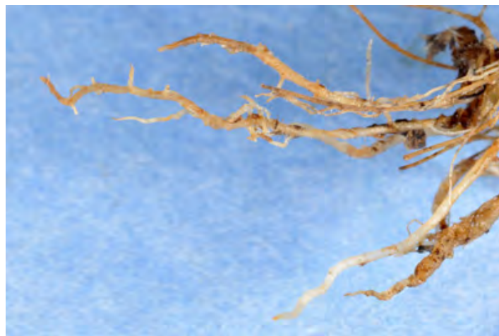
Close-up of needle nematode damaged wheat roots

not follow a regular pattern and are usually in patches. We have speculated that needle nematodes start their invasion of wheat roots in the fall. Early in the following spring, when soil temperatures rise to above 50°F, needle nematodes can also invade the established wheat roots. The tiny nematodes aggregate around the roots and with the aid of hollow needle-type mouth parts suck the juice out of the wheat roots. Needle nematode activity usually starts when soil temperatures reach 50°F and usually ceases when soil temperatures rise above 85°F. If you have noticed patches of stunted wheat in sandy soil and previously had similar issues on corn, needle nematode might be the problem. In this case, you may wish to send the entire root system with adjacent soil to the Nematology Laboratory (address below) at Purdue University for analysis, to rule out the nematodes. Samples must be kept cool and prevented from drying. As the soil temperature warms up, this might be a good time to start sampling for needle nematodes on wheat.