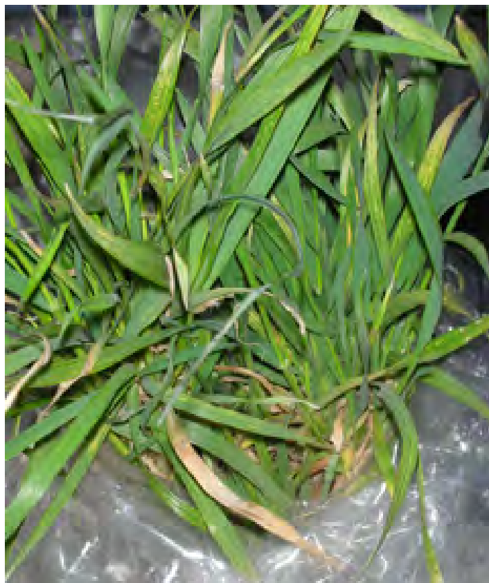
Figure 3. Yellow streaks and mosaic on leaves caused by soilborne viruses (WSSMV; SBWMV)

The level of symptom expression can depend on variety susceptibility. Soilborne wheat mosaic virus can cause a rosette symptom in susceptible varieties, which results in excessive production of severely stunted tillers. We have also observed reddish coloring on lower leaves of wheat plants infected with soilborne viruses (Figure 4). Plants infected with either virus may produce fewer stems and heads, and have reduced kernel number.