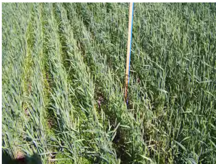
Severely damaged area of field