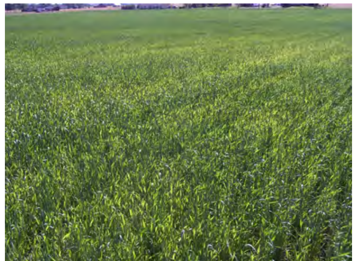
Needle nematode damaged area of wheat field