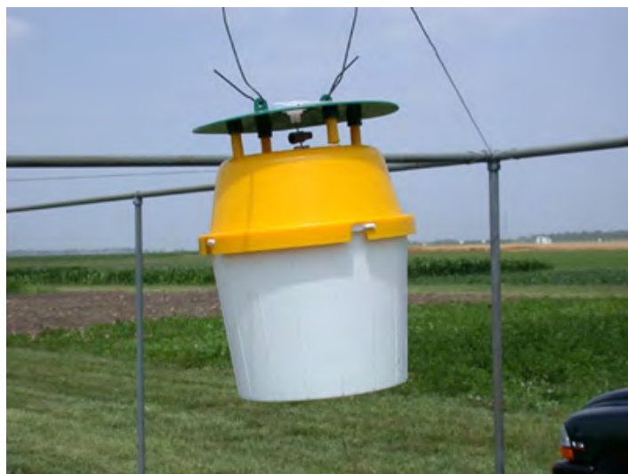
Black cutworm pheromone trap cooperators are using this bucket trap to monitor their arrival

will begin accumulating heat units (HU base 50°F) to determine when the first cutting of corn by the larvae should occur. This occurs approximately 300 HU after the intense capture. Watch for this information and Black Cutworm Adult Pheromone Trap Reports in future issues of the Pest&Crop .