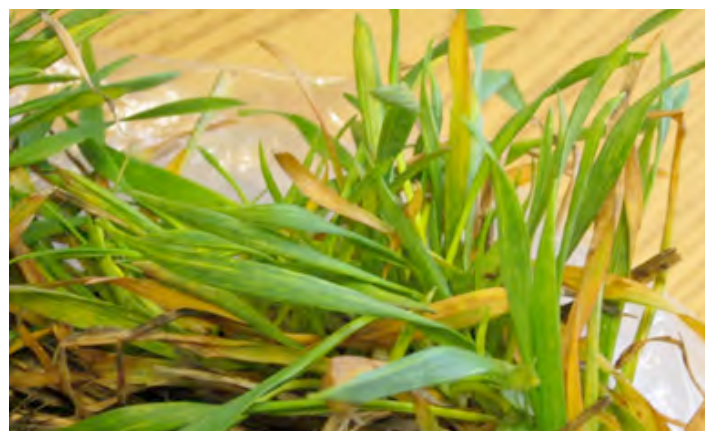
Figure 2. Yellow "spindles" on leaves characteristic of soil-borne virus disease (WSSMV)