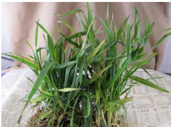
Figure 1. Wheat exhibiting symptoms of soilborne virus diseases (WSSMV; SBWMV)

Virus diseases of wheat are difficult to tell apart in the field and require lab testing for accurate diagnosis. Infected plants typically first appear in uneven patches of yellow or light green within a field, which can be confused with nitrogen deficiency or winter injury. Often, symptoms appear first in low or poorly-drained areas of the field. With soil-borne mosaic viruses (WSSMV and SBWMV), yellow-green streaks may be present on leaves and stunting and/or dieback of leaf tips can occur in infected plants (Figures 1, 2, and 3).