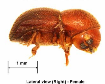
Lateral view (Right) - Female

Xylosandrus crassiusculus (Motschulsky) Synonym: Asian ambrosia beetle