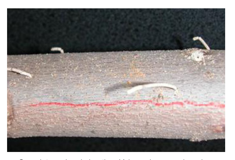
Granulate ambrosia beetles, Xylosandrus crassiusculus (Motschulsky) attack the trunk of the tree and push the frass out of galleries in a typical toothpick fashion. The beetles inoculate the galleries with ambrosia fungus on which the brood feeds.

CONTROL: Pyrethroids have been found to provide control of attacking adults if applied prior to the closing of the galleries with frass. Once the beetles are in the tree and have frass packed in the entry holes they are isolated from the outside. If infestations occur, affected plants should be removed and burned and trunks of remaining plants should be treated with an insecticide labeled for this pest or site and kept under observation.