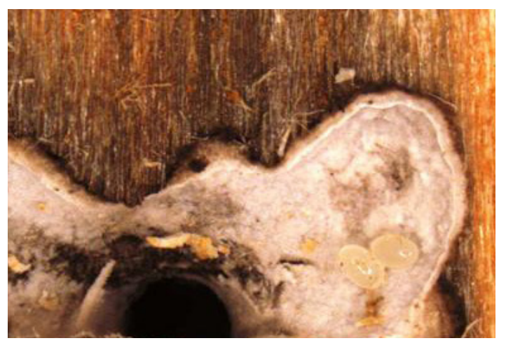
Granulate ambrosia beetles, Xylosandrus crassiusculus (Motschulsky) entrance hole, feeding gallery with eggs, and ambrosia fungus. The beetles inoculate the galleries with ambrosia fungus on which the brood feeds.

DAMAGE: Females bore into twigs, branches, or small trunks of susceptible woody plants and push the frass out of galleries in a typical toothpick fashion (see photo to the right). The beetles inoculate the galleries with ambrosia fungus on which the brood feeds.