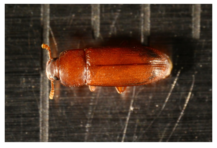
Red flour beetle adult.