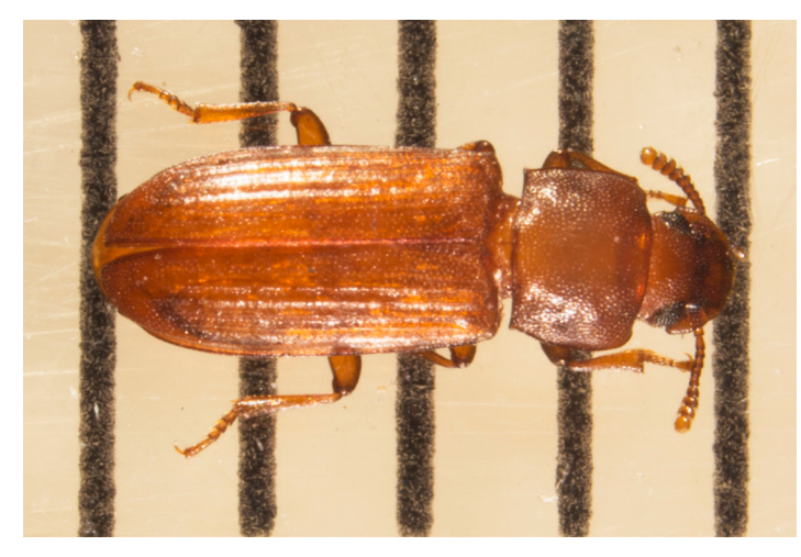
Counfused flour beetle adult.

low as 8%. Average fecundity is 400-500 eggs per female, with peak oviposition occurring during the first week. Adults may live longer than 3 years, and females may lay eggs for more than a year.