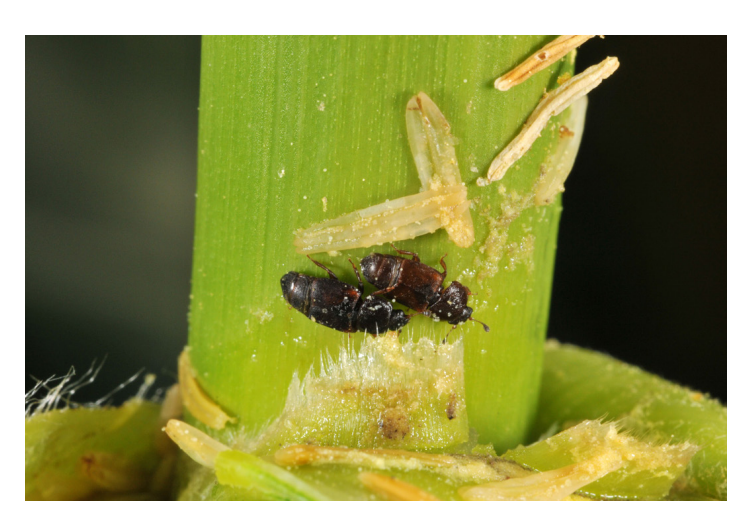
Sap dusky beetles on corn leaf axil.

Larval stages are very active and will try to hide if disturbed. Adults are active during the day and night and although resistant to flight, can migrate up to 2 miles in 4 days. Adult sap beetles are drawn to volatiles from fermenting fruit and grains, thus sanitation is important in controlling these pests. Female dried fruit beetles can lay over 2,134 eggs at 28.1°C (83°F), however the average is 1,071 eggs in her lifetime. The pre-oviposition, oviposition, and post-oviposition periods are 3, 61, and 9 days respectively.