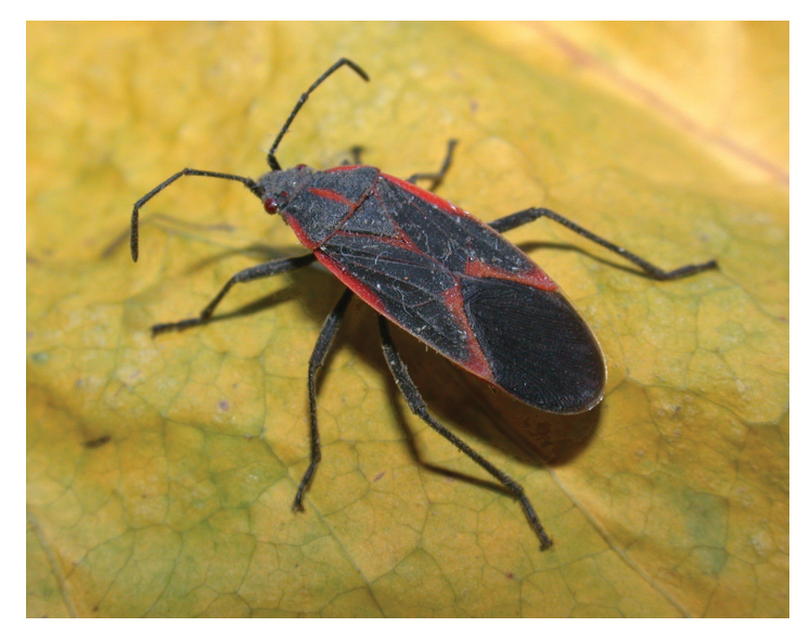
Boxelder bug.

Adult boxelder bugs are approximately 1/2 inch in length, dark brown to black in color with conspicuous red markings on their backs. The young (nymphs) are bright red and wingless but are generally similar in shape to the adults.