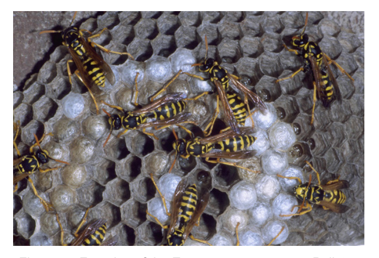
Figure 4. Females of the European paper wasp, Polistes dominulus , on their nest.

species is increasingly common in urban areas and workers are more prone than native species to sting in defense if their colony is disturbed. The common names "paper wasp" and "umbrella wasp" are descriptive because the papery nest consists of a single comb that is not enclosed within an envelope and nests usually resemble an umbrella in shape when they are suspended from eaves of a building. Their colonies are much smaller that those of yellowjackets and hornets, usually containing fewer than a hundred workers.