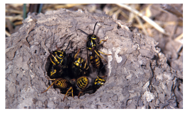
Figure 3. A view into the entrance tunnel of a ground nest of a yellowjacket.

The social wasps that are of greatest medical risk (equal to honey bees and for many of the same reasons) throughout the U.S. are the yellowjackets and to a lesser extent the hornets . Both groups exist in colonies containing hundreds to several thousand workers associated with a nest made of papery material. Yellowjacket and hornet larvae are reared in cells formed into multiple combs that are fully enclosed within a thick papery envelope. Paper wasps , or umbrella wasps, are significant medical risks primarily in the southern and southwestern U.S. However, the relatively recent establishment of a European species, Polistes dominulus , over much of the northern U.S. may change this situation because this