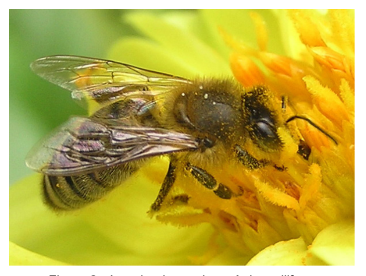
Figure 2. A worker honey bee, Apis mellifera.

abandoned rodent nests, and people rarely come in contact with them. Colonies of many species of bumble bees contain fewer than a hundred workers, and the workers are much less prone to sting than are honey bee workers. Little has been reported on the chemistry of bumble bee venoms, but they share at least some allergens with honey bee venom and have been associated with allergic reactions.