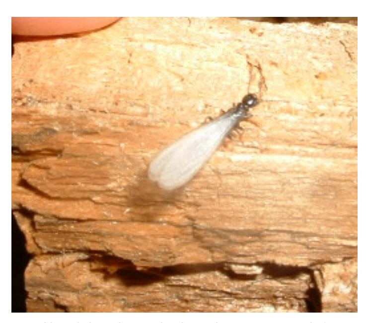
Alate (winged reproductive subterranean termite)