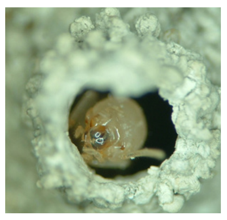
Worker termite in a mud tube

other masonry that separate wood from soil. They construct these tubes on the walls or inside them in voids and cracks. Occasionally, when a leaky roof or pipe provides moisture, termite infestations are established without soil contact.