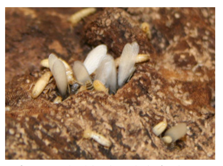
Swarmer termites (winged reproductive form known as kings and queens)

Property owners need to be aware of termites and the destruction they can cause. Consumers also need to be generally knowledgeable of when and where termite control or prevention is needed, and how prevention or control may be accomplished. When buying property, building a home or adding on to an existing structure, or making a decision on treating an existing infestation in a building, the information that follows should be useful.