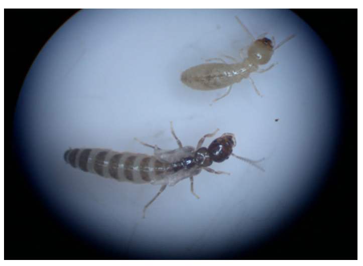
Top: Worker termite and bottom: reproductive termite