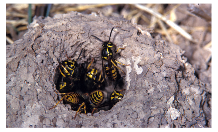
Yellowjacket ground nest

Paper Wasps: These slender, long-legged wasps exist in small colonies associated with a single, exposed nest comb that typically is suspended from eaves or in outbuildings.