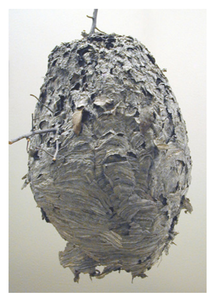
Nest of the baldfaced hornet

Sprays should be directed into the nest entrance (typically located near the bottom of the nest), and the entire nest should be thoroughly soaked. Many pressurized products for home insect control are not effective. Look for products with synergized pyrethrins plus petroleum distillates (e.g., Wasp Freeze®) which freezes the wasps upon contact. Colonies situated high in trees far from human activity should be left alone.