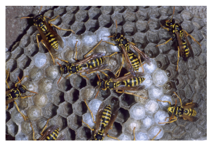
European paper wasp (Polistes Diminulus)

European Paper Wasps (Dominulus) have recently become very common in Indiana. These paper wasps often build nests inside enclosed voids of lighting fixtures, bird boxes, gas grills, motor homes, boats and other infrequently used spaces. This often creates unexpected encounters with people and has let to an increase in stings to people. Colony destruction is best accomplished with any number of pressurized products containing quick knockdown materials such as resmethrin and synergized pyrethrins (Wasp Freeze®, Wasp Stopper®, Bee Bopper®, etc.). Stand well away from the colony and completely soak the nest material. Remember that paper wasps are highly beneficial caterpillar predators and relatively nonaggressive. Therefore, avoid controlling them unless colonies present a direct stinging threat.