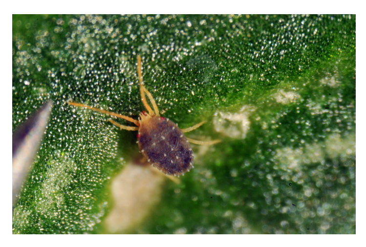
Clover mite